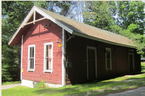
Newfane Depot, Cemetery Hill Road, Newfane Village

The Brattleboro & Whitehall Railroad company was formed with initial plans to run from Brattleboro, Vermont, to Whitehall, New York. The Railroad only made it as far as South Londonderry and later became known as the West River Railroad. The Railroad was a community sponsored project starting in the 1850s. The narrow gauge had many mishaps and became known as "The 36 Miles of Trouble." A 1903 editorial called the trains "try-daily — they go down in the morning and try to get back at night." By the 1930s, the West River Railroad was out of business. Today, parts of the old railroad bed serve as a recreational hiking trail.